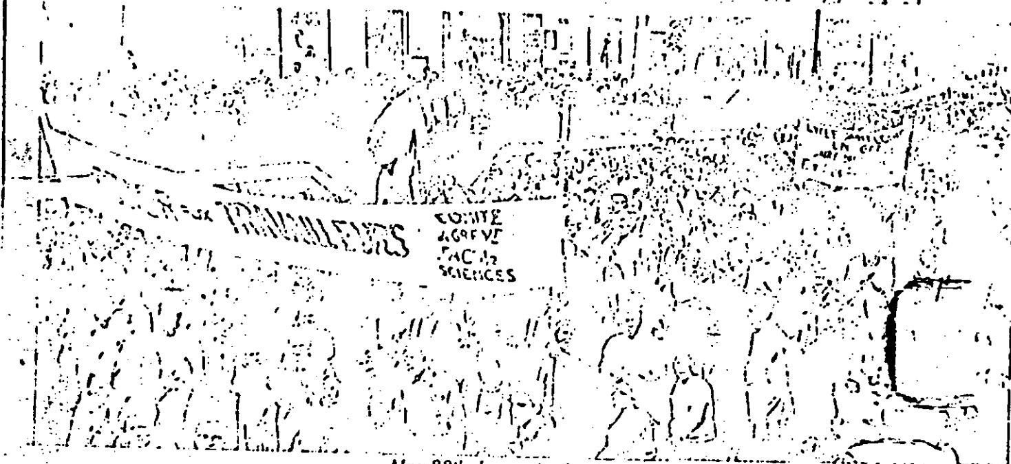
May 29th demonstration in Paris